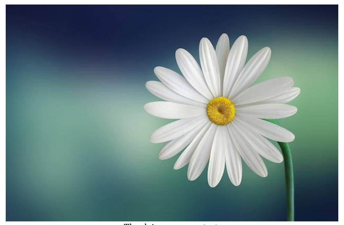
The daisy....a new start.

We can all make a difference from today.